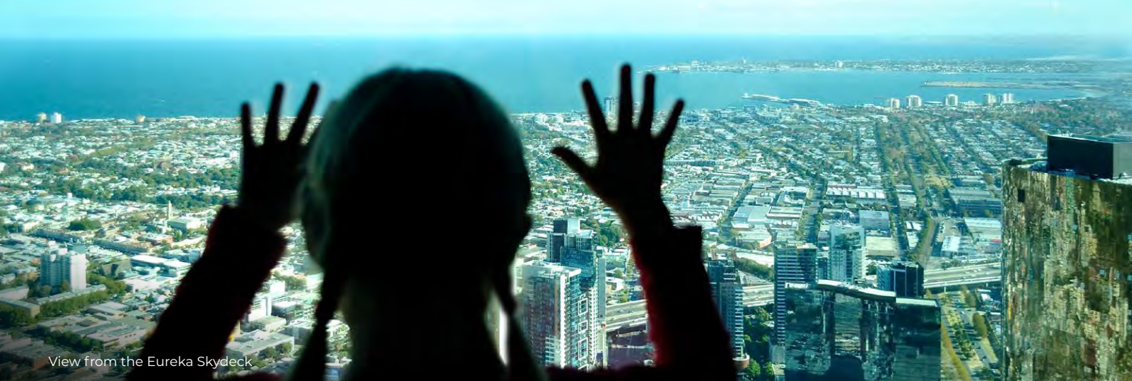
View from the Eureka Skydeck