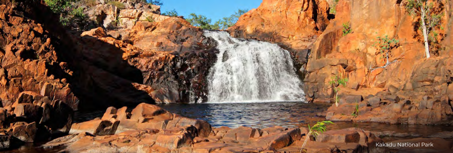
Kakadu National Park