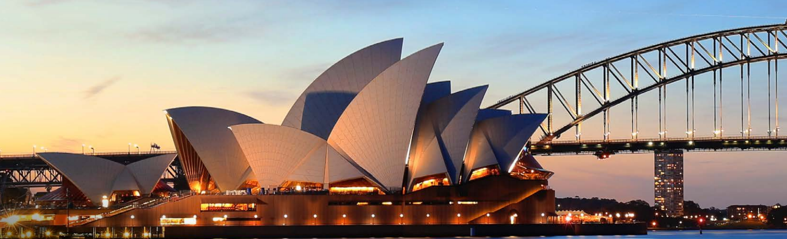
Sydney Harbour Bridge and Opera House