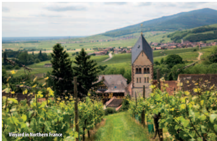
Vineyard in Northern France