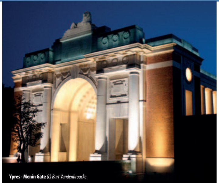
Ypres - Menin Gate