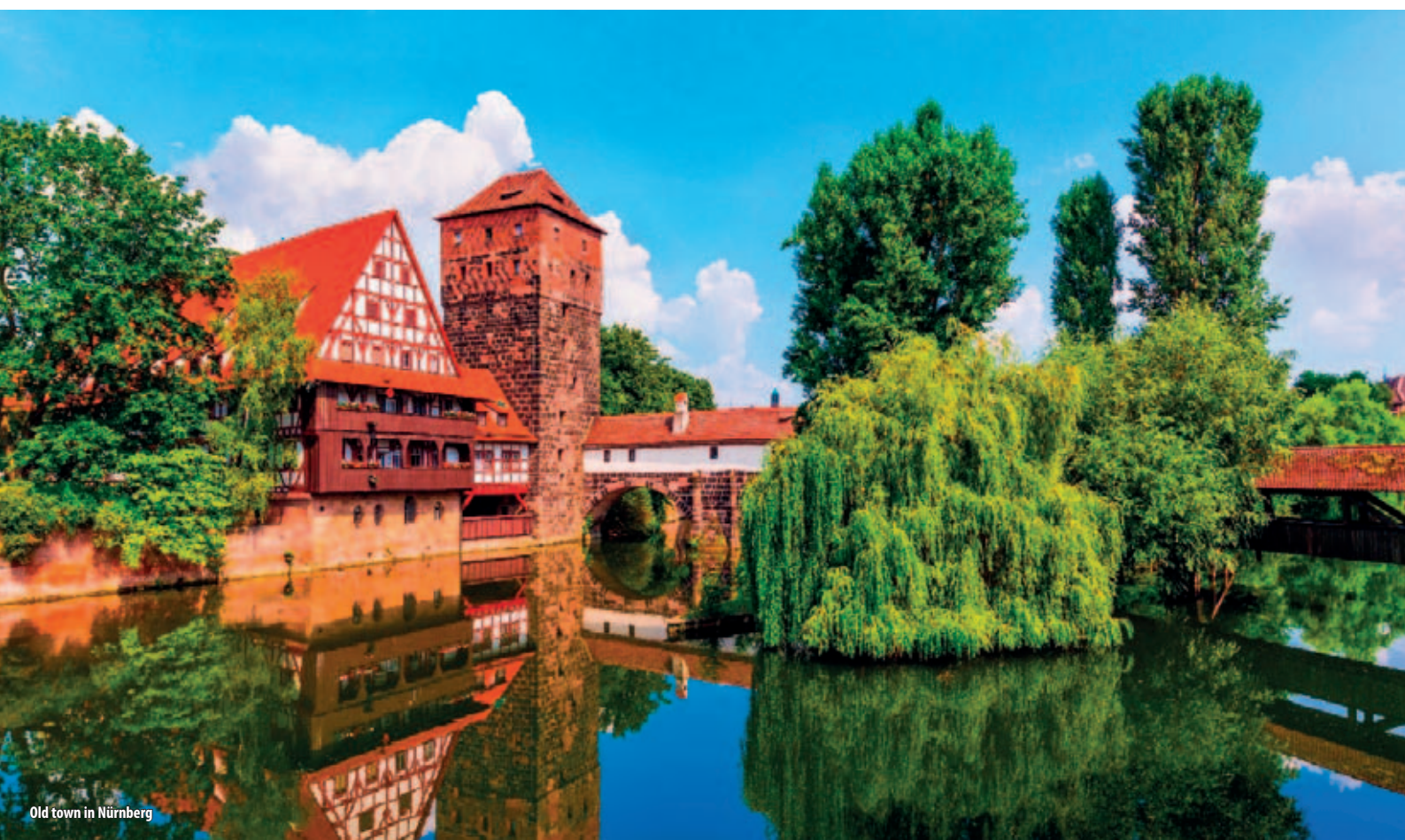
Old town in Nürnberg

Please visit our website for the current tour costing.