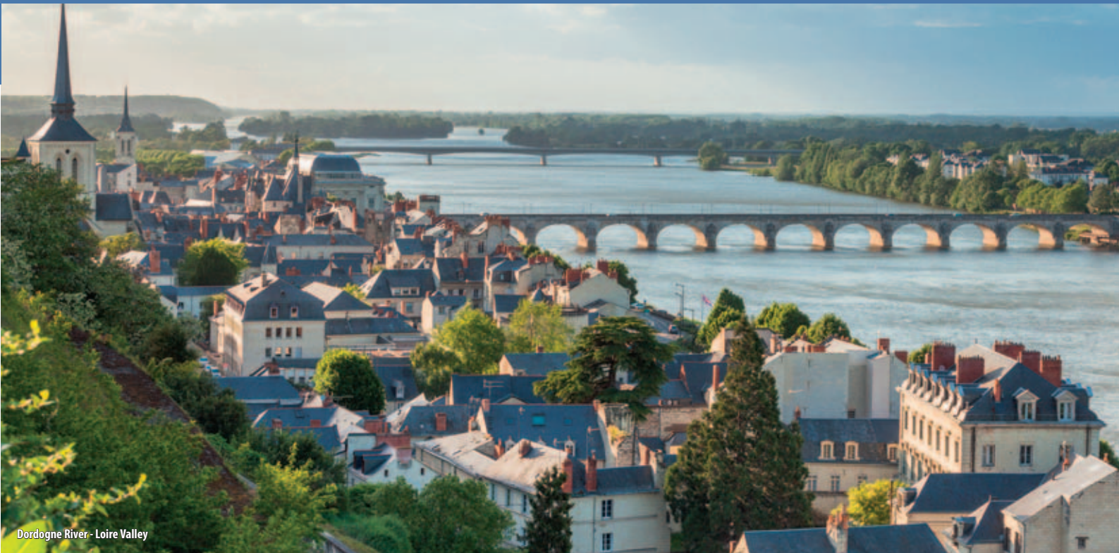
Dordogne River - Loire Valley

The first 5 days are in the bustling 14th arrondissement of Paris, featuring experiences designed to incorporate integrated learning. Students will then travel to the stunning Loire Valley.