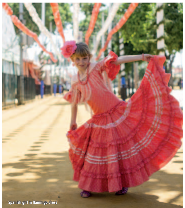
Spanish girl in flamenco dress

Please visit our website for the current tour costing.