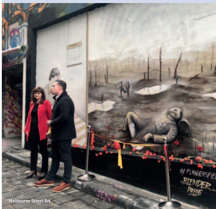
Melbourne Street Art

For more information visit: www.getours.com.au/tour-focus/art