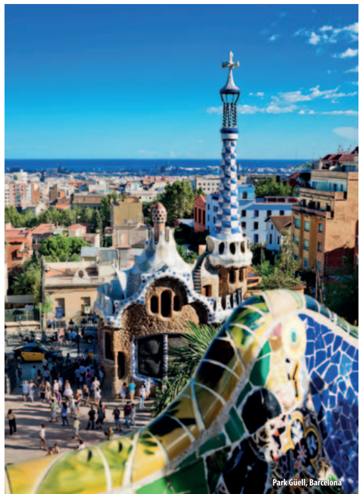
Park Güell, Barcelona

Please visit our website for a full list of tour inclusions and current tour costings.