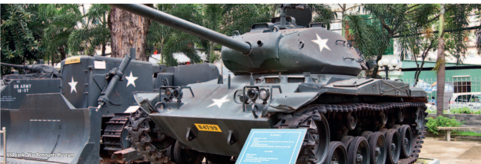
USA tank - War Remnants Museum

Please visit our website for the current tour costing.