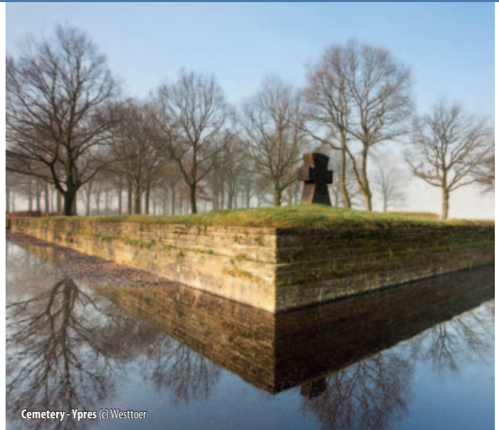
Cemetery - Ypres