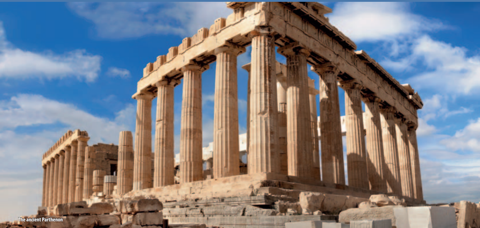
The ancient Parthenon

Students of history, get excited! Experience the wonders of ancient history up close in the birthplace of Western civilization, Greece and Italy. This 13 day tour begins in Athens, then onto to Delphi and the stunning Temple of Apollo. The Italian leg of the tour includes the wonders of Pompeii, the Colosseum and the Roman Forum. During the tour there is also plenty of time for students to explore modern Greece and Italy and experience their rich cultures.