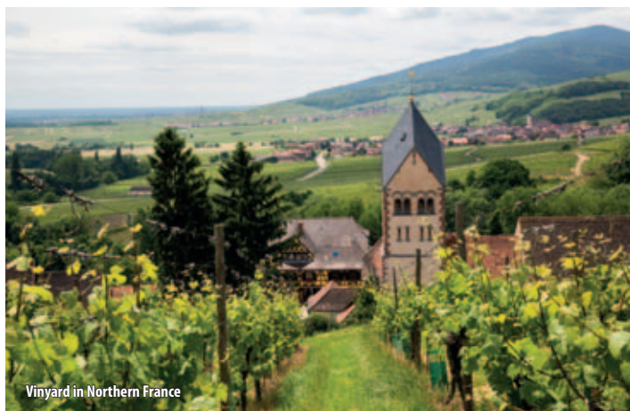
Vineyard in Northern France