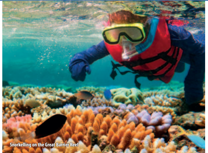
Snorkelling on the Great Barrier Reef