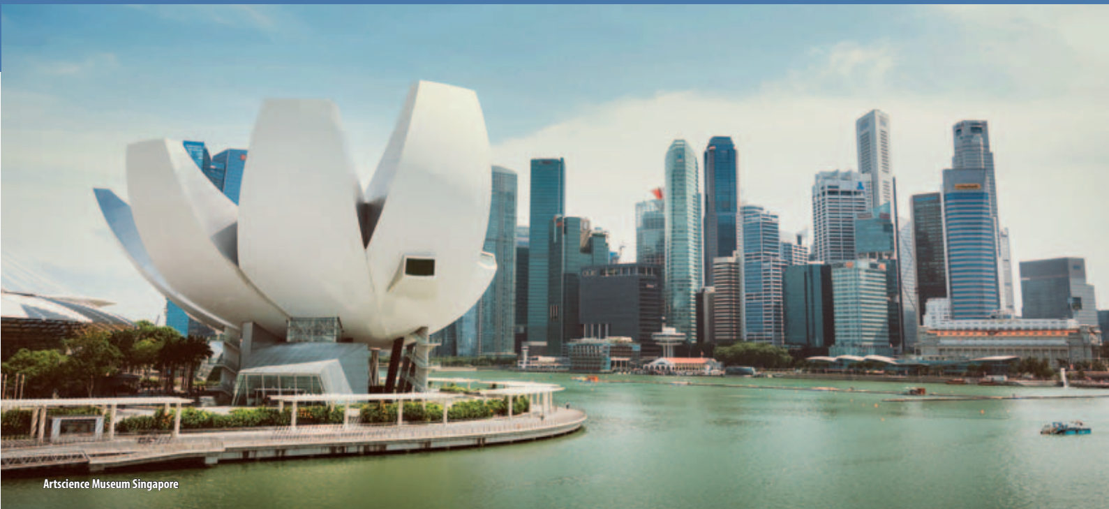
Artscience Museum Singapore

Singapore is fast becoming a destination of interest for Australian STEM teachers as a safe and exciting destination for student groups. Suitable for students in years 9 to 12, Singapore combines quality STEM experiences with history and culture, arts and adventure.