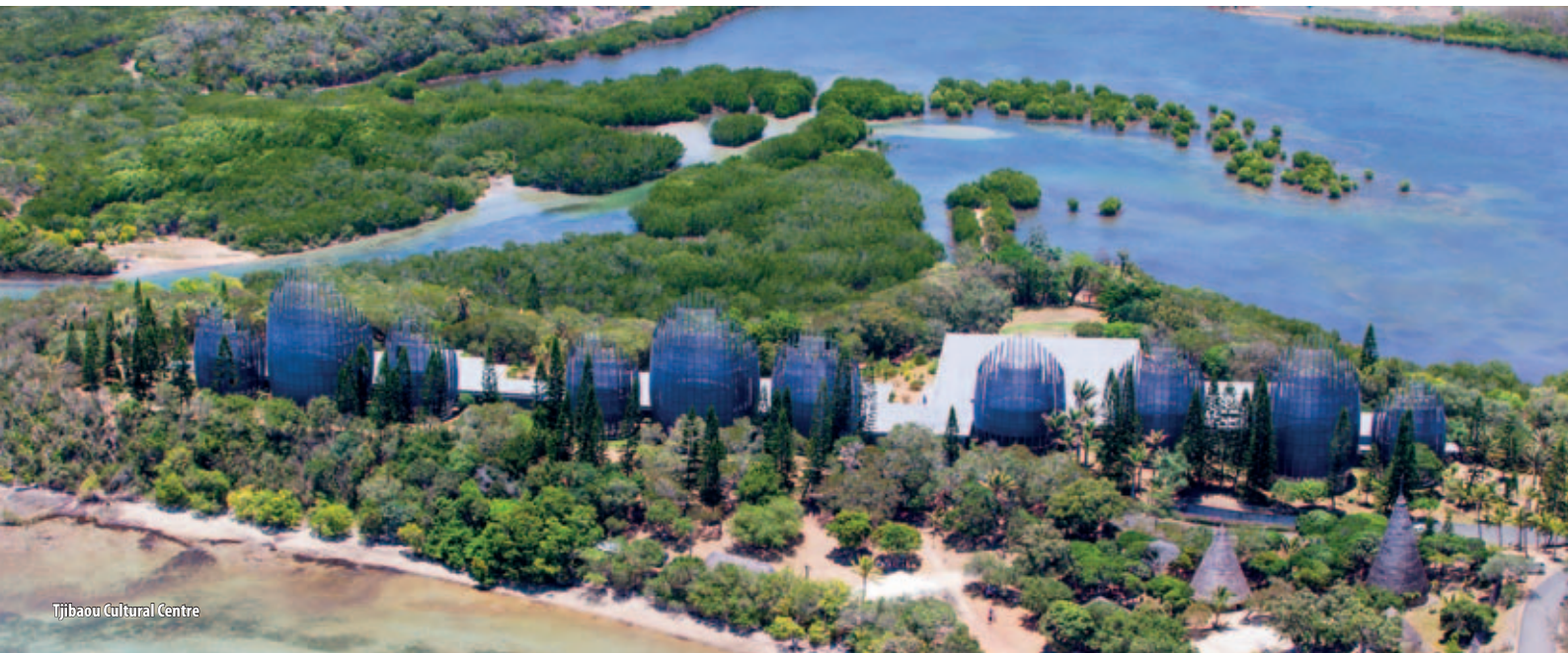
Tjibaou Cultural Centre

G.E.T is a proud member of the following professional industry associations.