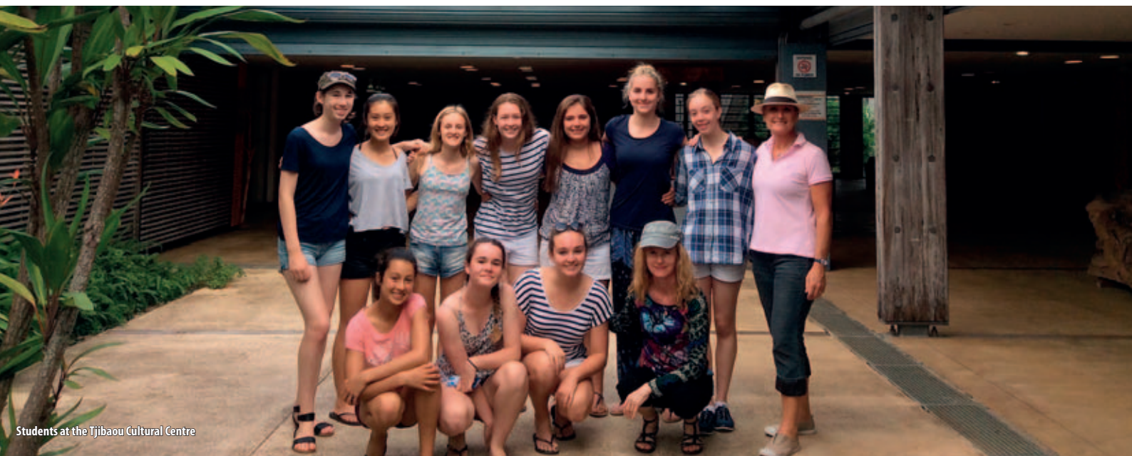
Students at the Tjibaou Cultural Centre

*Prices correct on September 30th 2017 and is based on low season airfare. Variation in price may occur due to changes such as departure city, seasonality and fluctuations in currency exchanges. Price is based on 22 paying passengers.