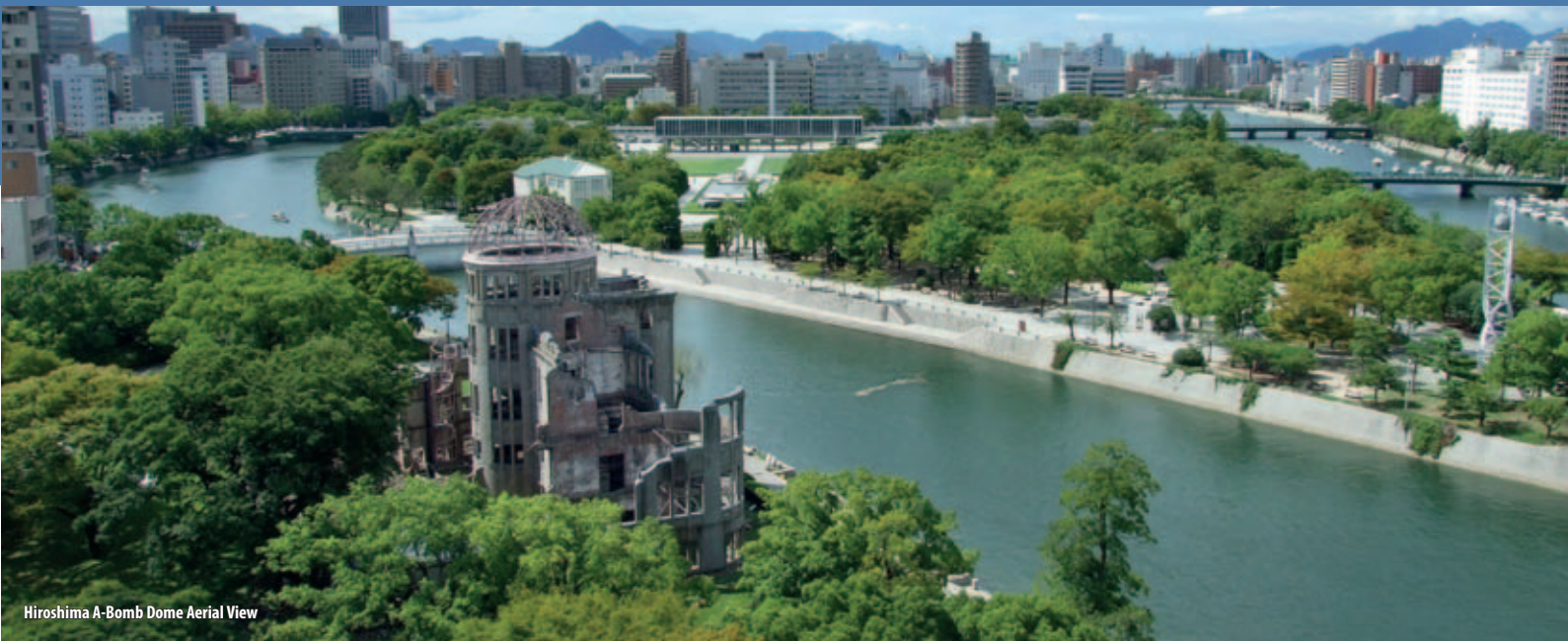
Hiroshima A-Bomb Dome Aerial View

A great tour to combine with your sister school visit. Introduce your students to Japanese culture and language, visiting the many key destinations along Japan's 'Golden Route'. An ideal tour for first-time travellers and tailored to both primary and secondary students, the itinerary is designed to place students into language-rich environments so that they improve their language skills and gain a greater understanding of Japanese culture.