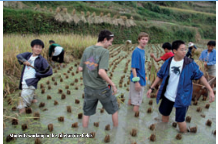
Students working in the Tibetan rice fields