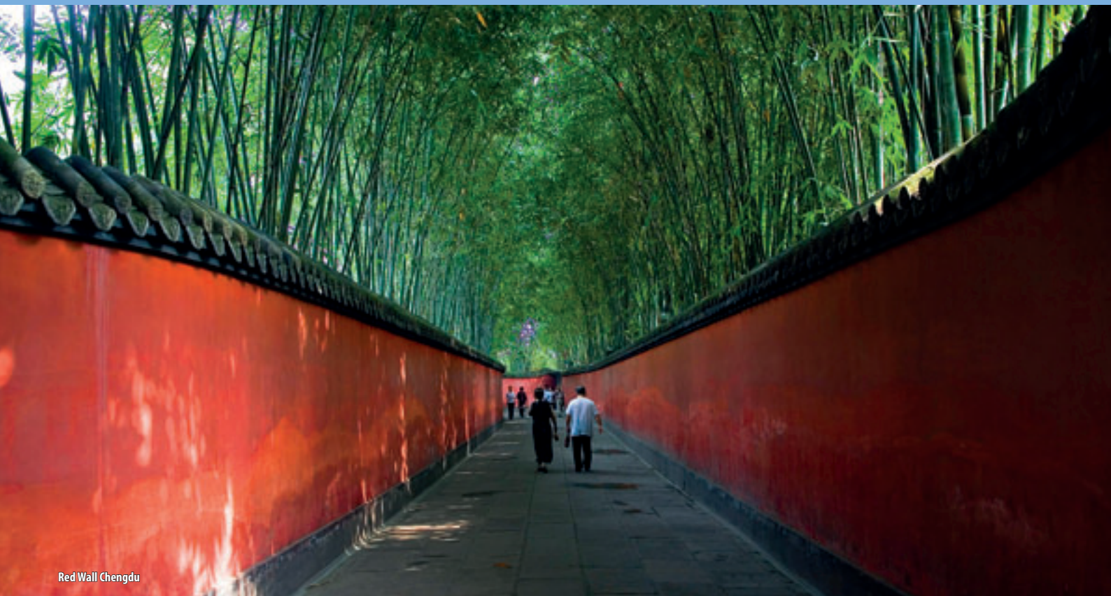
Red Wall Chengdu

From the ancient capital of Xian to the marvels of Beijing and the modern wonders of Shanghai, this 10-day tour immerses students in contemporary and historical China.