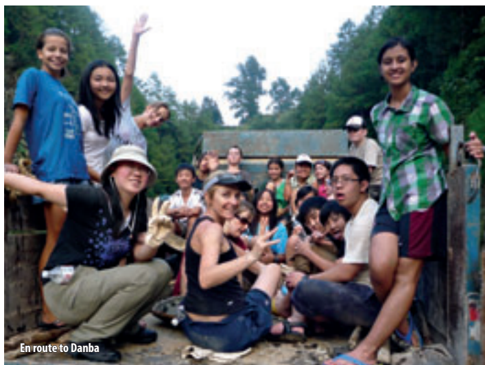
En route to Danba