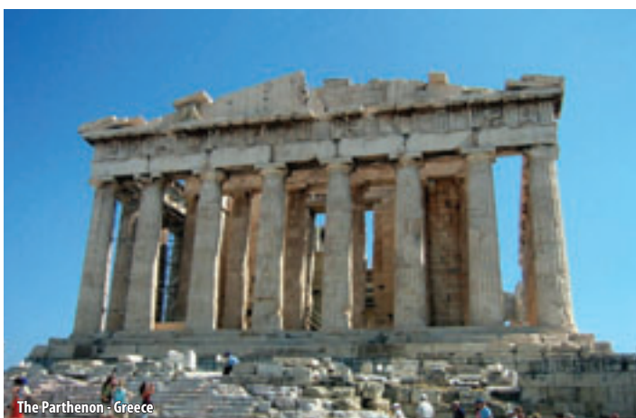
The Parthenon - Greece