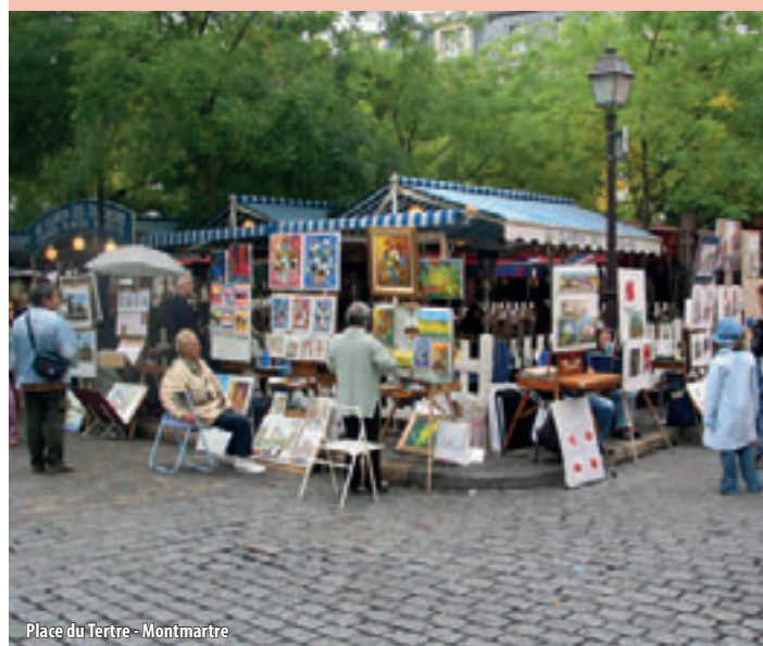
Place du Tertre - Montmartre

Due to the extensive coach travel, this tour is recommended for groups of 22 or more students