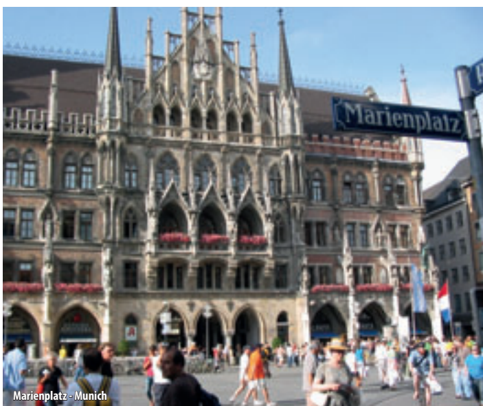
Marienplatz - Munich