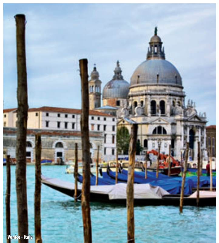
Venice - Italy

* Lessons available Monday to Friday only.