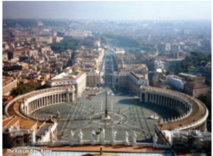
The Vatican City - Rome

After breakfast meet your guide for a half day walking tour of Ancient Rome including the Colosseum and the Roman Forum. A 3 Day Roma Pass for public transport is included. You can use this pass as you enjoy a free afternoon for individual sightseeing (at your teachers' discretion). Dinner included this evening.