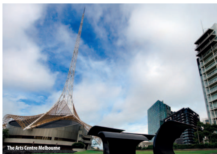
The Arts Centre Melbourne

Please visit our website for the current tour costing.