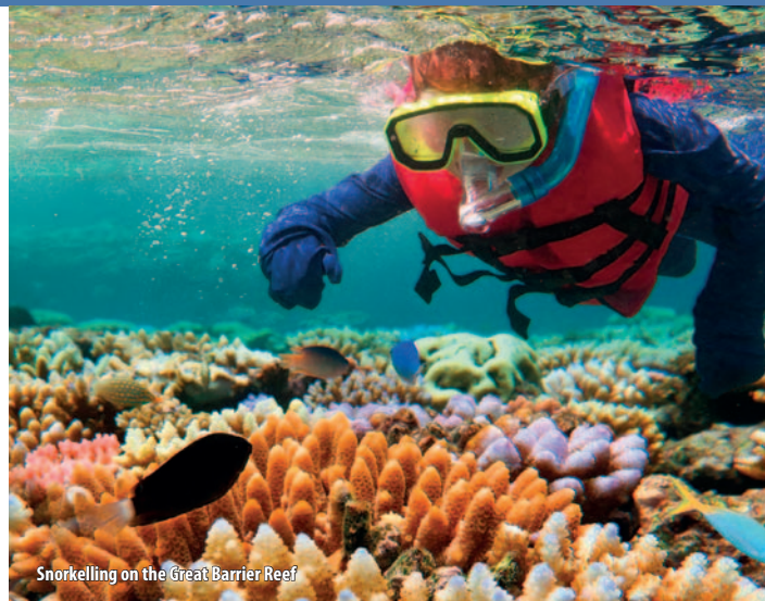
Snorkelling on the Great Barrier Reef