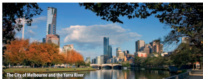
The City of Melbourne and the Yarra River

Please visit our website for the current tour costing.