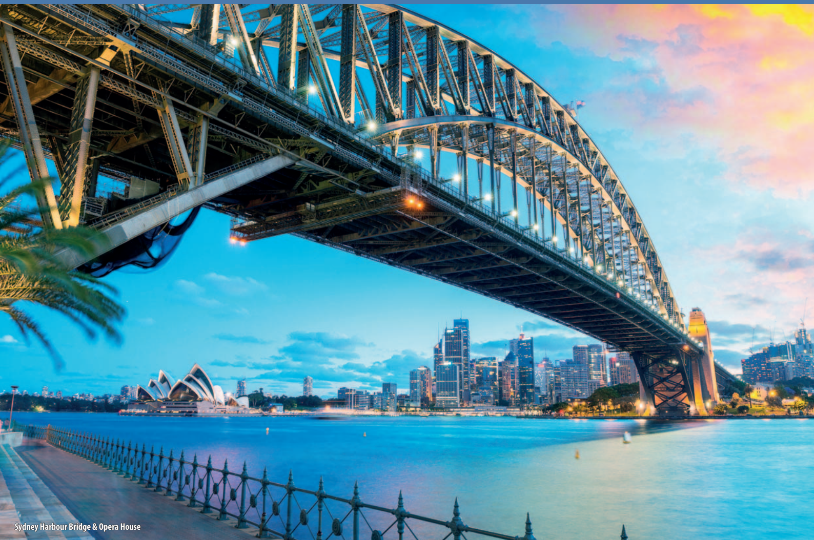
Sydney Harbour Bridge & Opera House