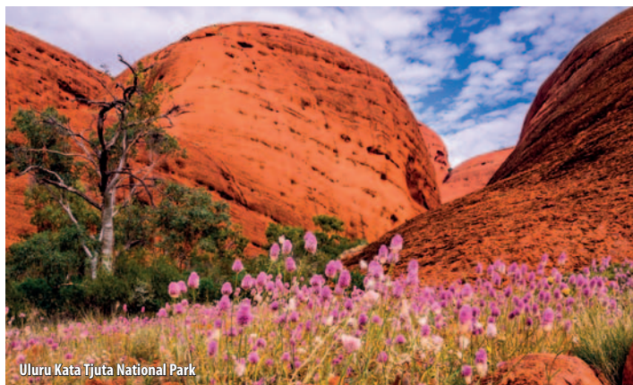
Uluru Kata Tjuta National Park

This morning, climb to the top of the canyon rim and be rewarded with spectacular views. Marvel at the sight of red sandstone walls plunging into lush vegetation and natural rock pools. Here, you will truly feel as if you are in the heart of Australia. After packing up and leaving Kings Canyon, travel at leisure to Alice Springs. Set up camp for two nights.