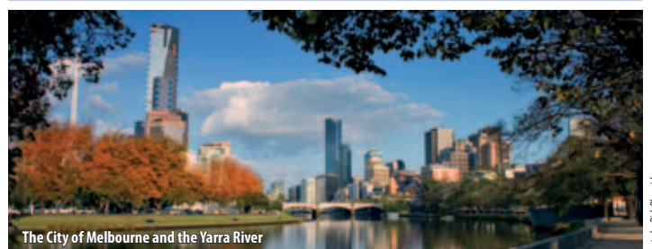
The City of Melbourne and the Yarra River

Please visit our website for the current tour costing.