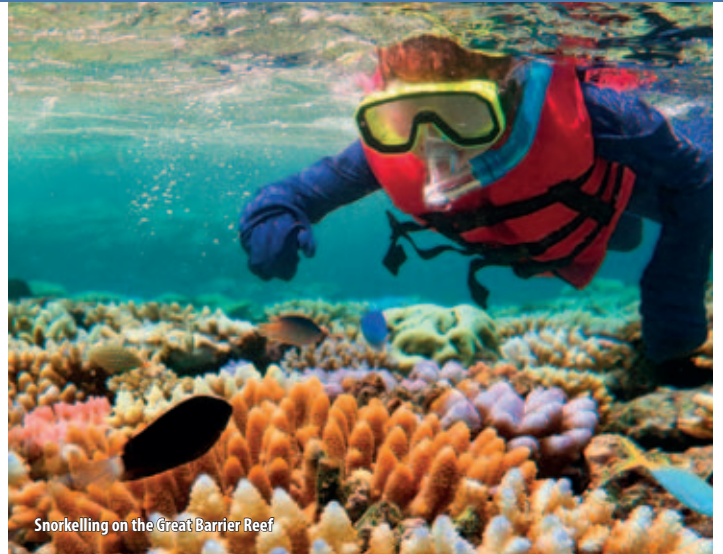
Snorkelling on the Great Barrier Reef