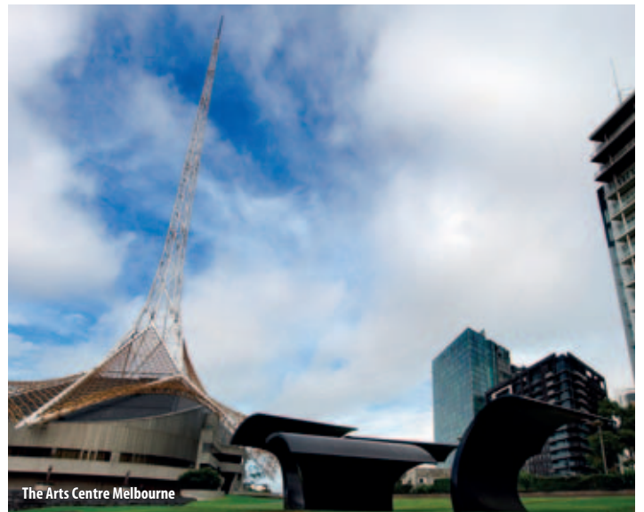
The Arts Centre Melbourne

Please visit our website for the current tour costing.