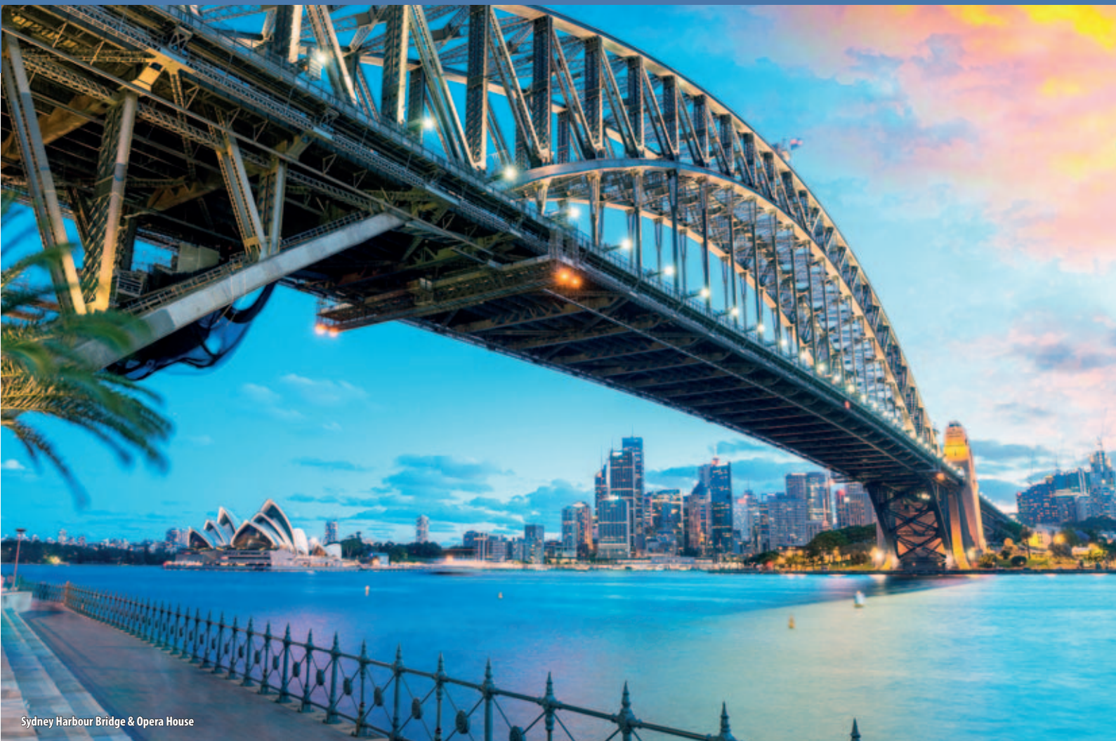
Sydney Harbour Bridge & Opera House