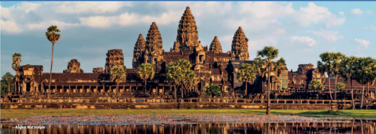
Angkor Wat temple

With strong curriculum links, this program provides a balance of potentially confronting experiences and robust discussions, complimented by providing time for reflection by students on the misinformation and stereotyped views of developing countries. Students will further develop their views on Human Rights, Social Justice and International Cooperation in relation to conflict resolution.