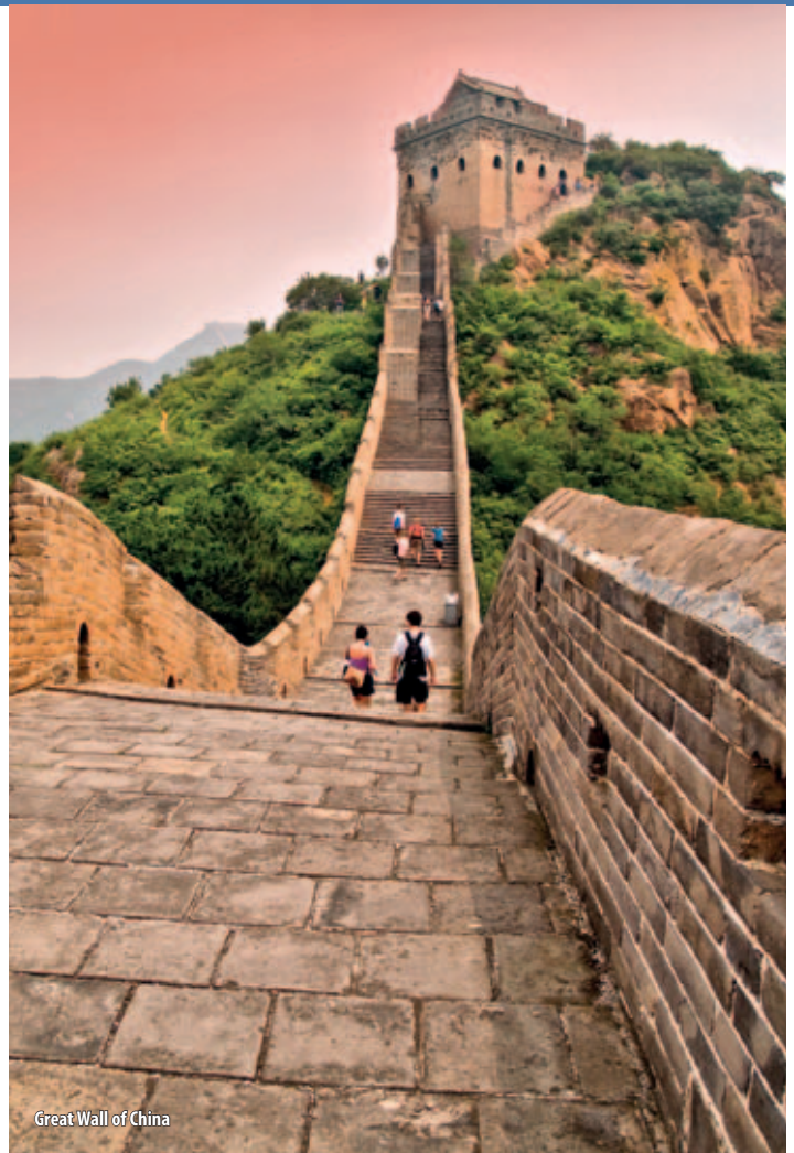
Great Wall of China

Did you know: We also offer the opportunity for students to sleep overnight in the Dinosaur Museum. Exclusive to G.E.T, we can arrange a camping night in the main auditorium and can also arrange a cultural exchange with a Chinese school of same age and gender.