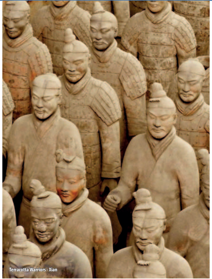
Terracotta Warriors - Xian