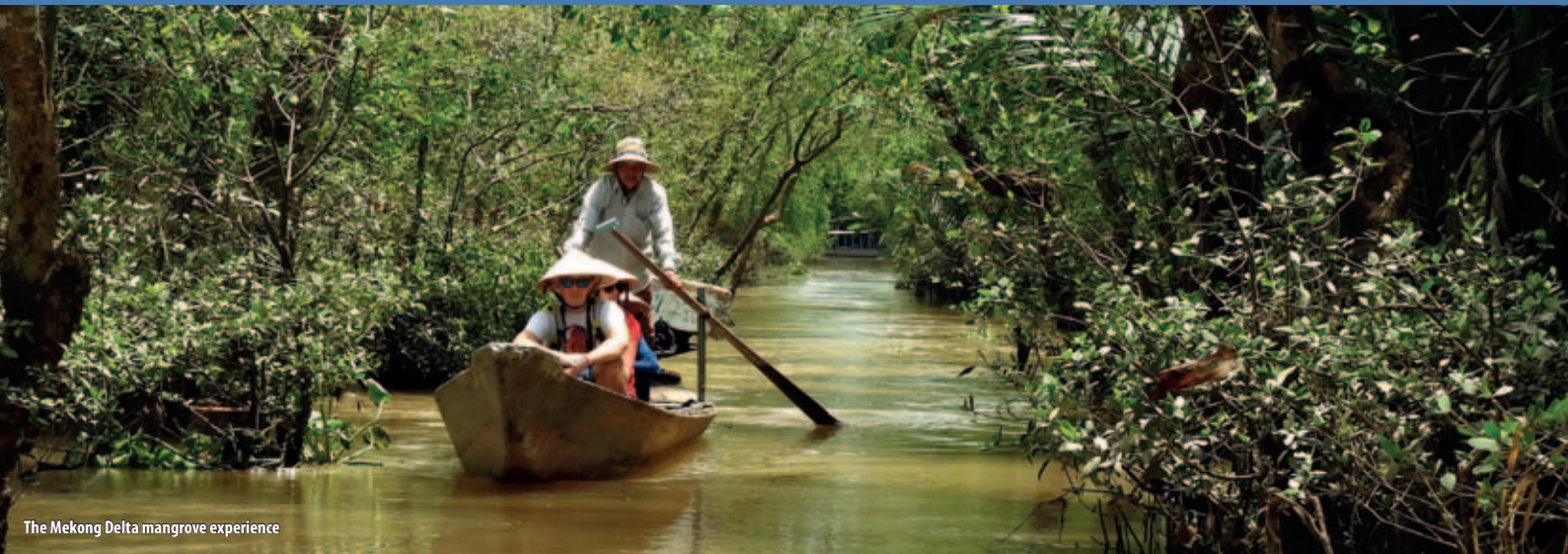
The Mekong Delta mangrove experience

Giving students a sample of life in modern-day Vietnam, this tour also provides important historical insights and interactive experiences with the people, culture and the food of Vietnam.