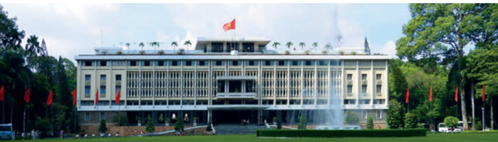
Reunification Palace - Ho Chi Minh City