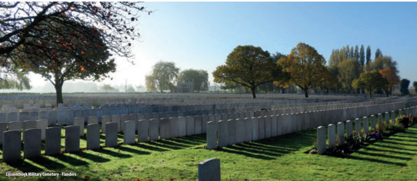
Lijssenthoek Military Cemetery - Flanders