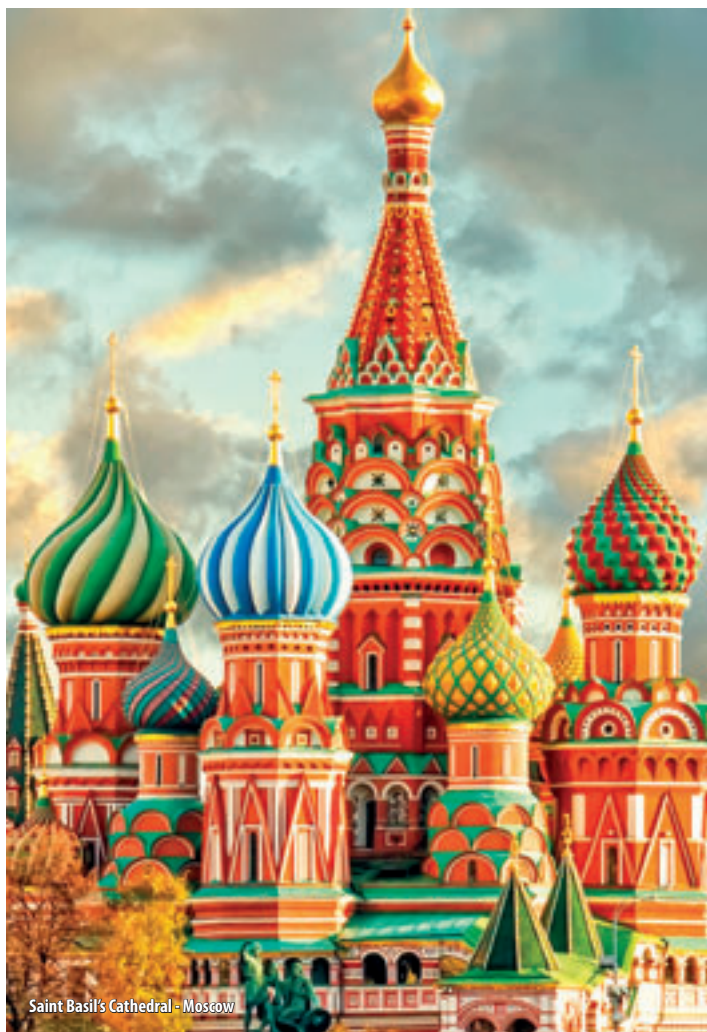
Saint Basil's Cathedral - Moscow