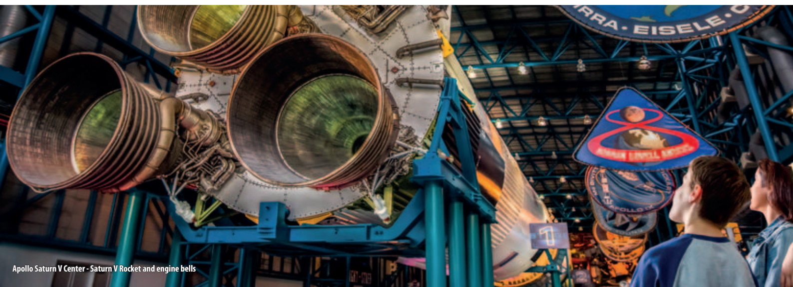
Apollo Saturn V Center - Saturn V Rocket and engine bells

Please visit our website for the current tour costing.