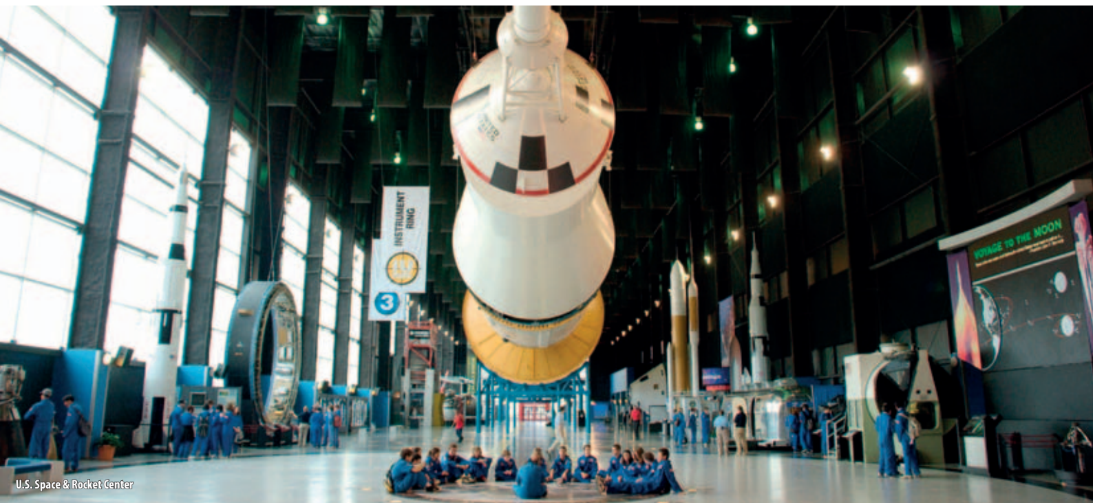
U.S. Space & Rocket Center

G.E.T is a proud member of the following professional industry associations.