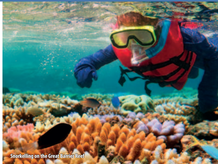
Snorkelling on the Great Barrier Reef