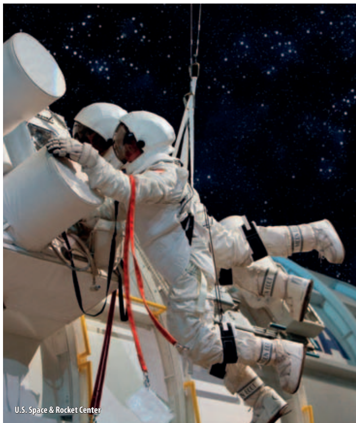
U.S. Space & Rocket Center