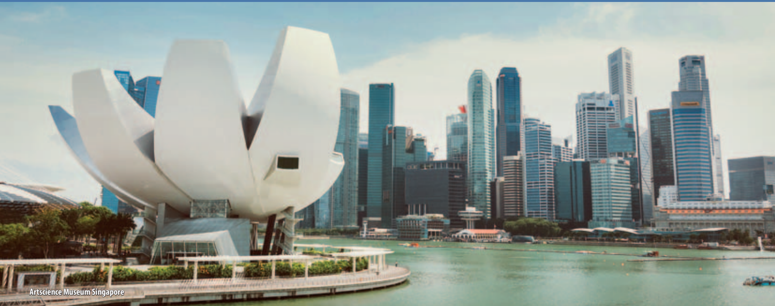
Artscience Museum Singapore

Singapore is fast becoming a destination of interest for Australian STEM teachers as a safe and exciting destination for student groups. Suitable for students in years 8 to 12, Singapore combines quality STEM experiences with history, culture, arts and adventure.