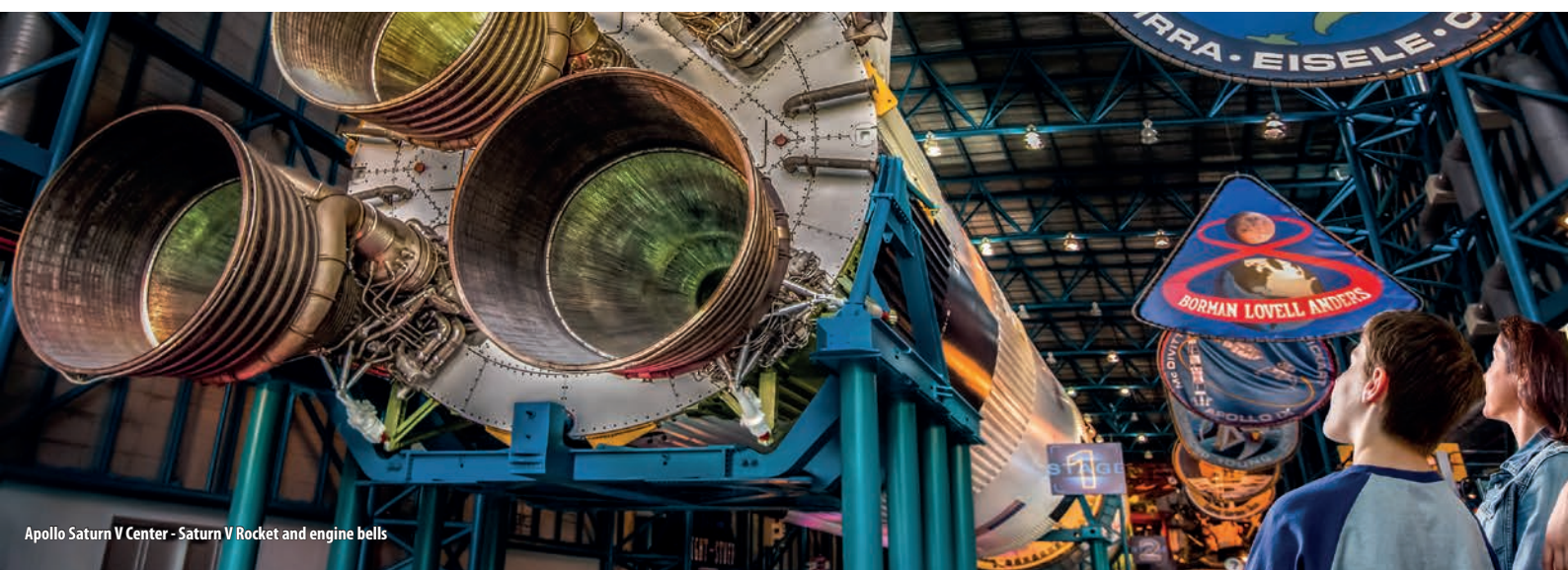
Apollo Saturn V Center - Saturn V Rocket and engine bells

Please visit our website for the current tour costing.