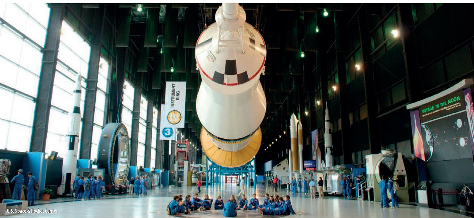
U.S. Space & Rocket Center

G.E.T is a proud member of the following professional industry associations.