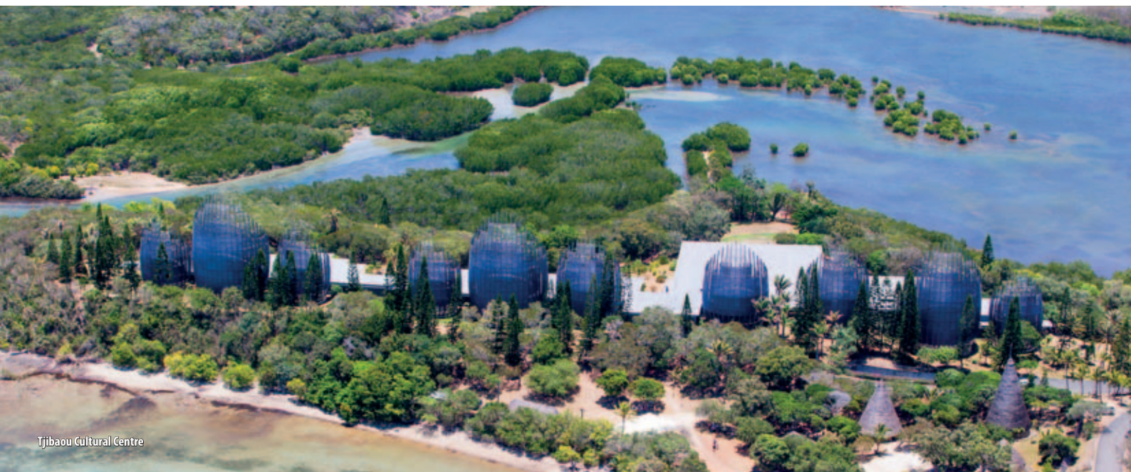
Tjibaou Cultural Centre

G.E.T is a proud member of the following professional industry associations.