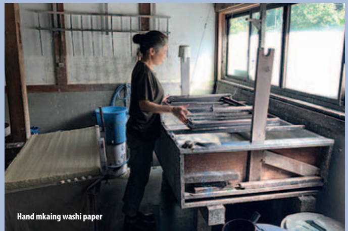
Hand mkaing washi paper