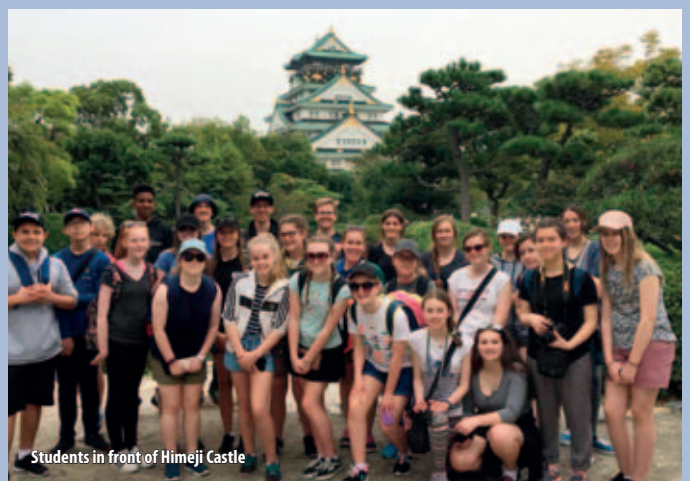
Students in front of Himeji Castle