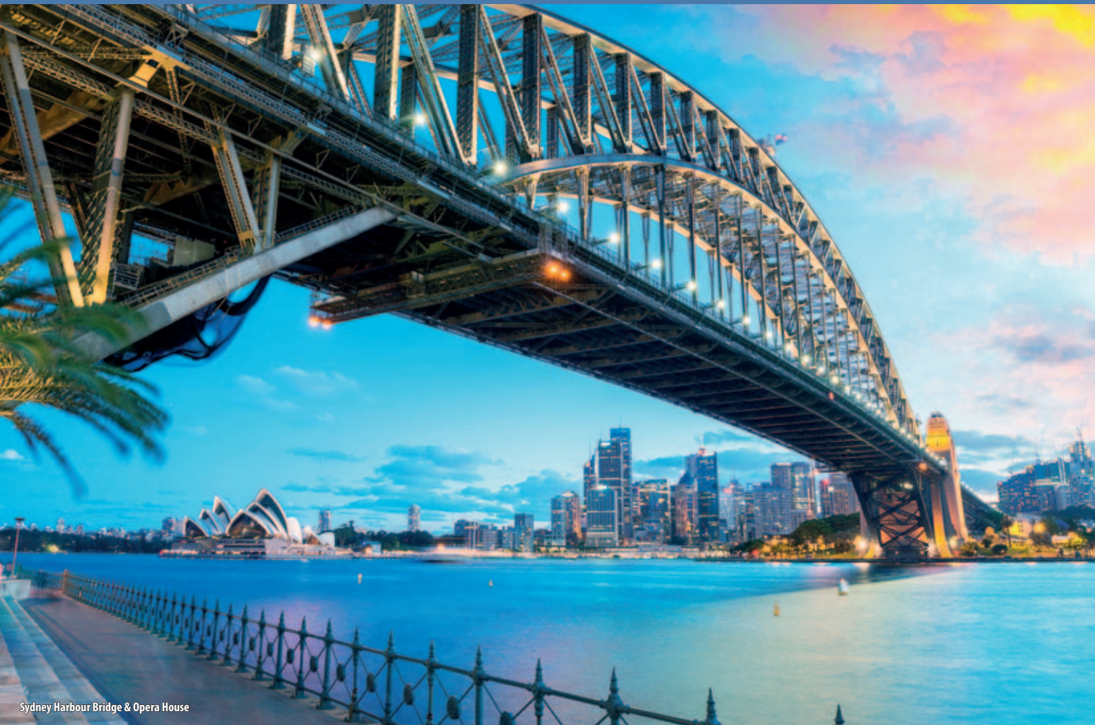
Sydney Harbour Bridge & Opera House