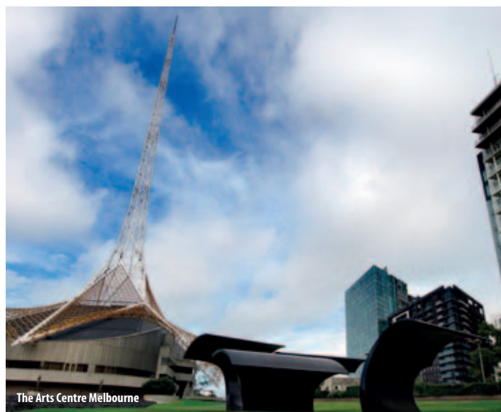
The Arts Centre Melbourne

Please visit our website for the current tour costing.